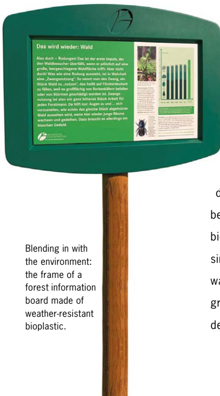
Blending in with the environment: the frame of a forest information board made of weather-resistant bioplastic.

Bioplastics have been around for a very long time. The first industrially produced plastics were based on cellulose, which is extracted from plants such as cotton. As early as 1869, the Hyatt brothers produced the bioplastic celluloid in the USA, and a few years later cellulose film, better known by its trade name cellophane, began to be mass-produced. However, the discovery at the beginning of the 20th century that plastics could be manufactured from crude oil led to the rapid supplanting of bioplastics, which remained on the back burner for many decades, since producing plastic from crude oil was significantly cheaper. It was not until the 1980s that rising crude oil prices, coupled with gradually emerging ecological awareness, led to interesting new developments in the field of bioplastics.