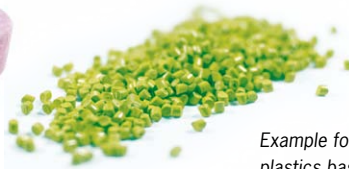
Example for a Flower pot made of plastics based on renewable raw materials (bio-based plastics).